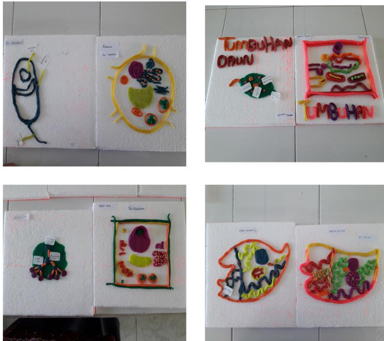
Figure 1. An example of a cell shape created by a student.

The left cell shape image was based on the students prior knowledge, and the right image was after the student learnt cell shape by concept. Finding on observation during the process of manipulating the shape of cell in second attempt (manipulating the shape of cell by concept), there were mistakes to form and give name of cell made, however, there was also a change of form in making the shape of cell. This result seemed to be satisfied as students applied their imagination into a masterpiece. Each of masterpiece made then analyzed by calculating the mean score and categorized them into high, medium and low (see figure 2 and figure 3).