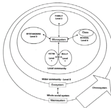
Figure 1. Bullying

Bullying may be a form of aggression all through which there's a power imbalance among the bully and therefore the victim taking place for the maximum part inside the coevals context. Bullying is diagnosed united of the student maximum sizeable problems in the schooling device, likewise united of the most essential health threats. Peer victimization can be a primary trouble round the sector and may be a painful a part of youth it's foreseeable, normal, and once in a while unspoken. Bullying has been proven to be risky, occurs altogether sorts of faculties, is additional not unusual in early youth, and will have semi-permanent consequences. Primarily based on the educational action of a student, there square degree versions inside the dating between bullying price and academic performance. Browbeaten students square degree afraid to come back to high school as a result of they assume they are Hazardous; so, they are unable to concentrate on re-electing their academic fulfillment negatively.